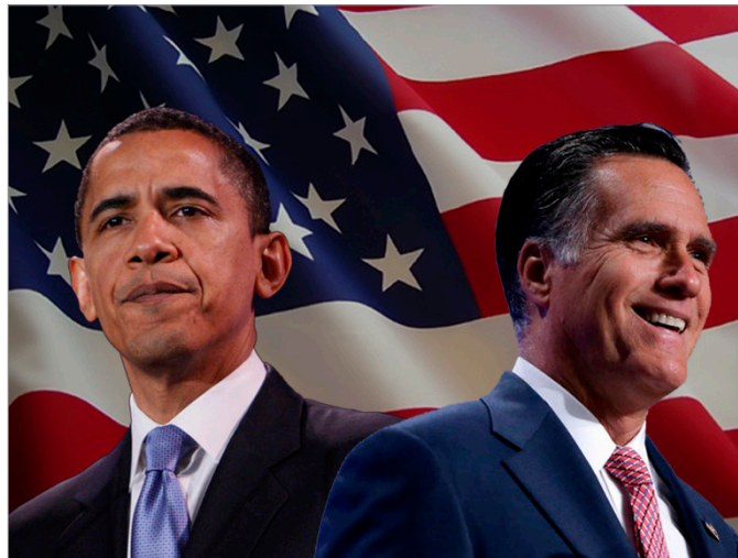
Barack Obama (l) and Mitt Romney (r)

While this modest study was not intended to produce a huge data set (and therefore statistical significance cannot be calculated), its value lies in the knowledge gained and lessons learned about remote viewing and the rating of human targets within a binary blind protocol; this has the potential to be useful to those designing and implementing their own remote-viewing projects in the future.